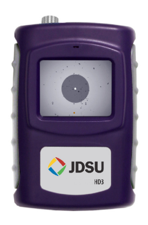
HD3 Handheld Display with 1.8-in LCD