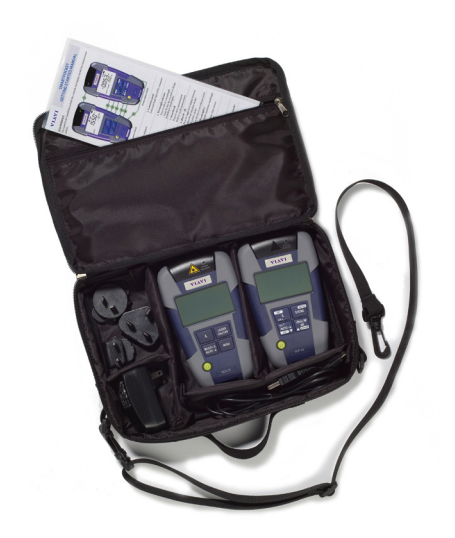
OMK-3x kit with light source, power meter, power supply, and USB cable.

Viavi OMK-3x optical test kits provide essential tools for power and insertion loss measurement and are ideal for a wide range of installation and maintenance applications.