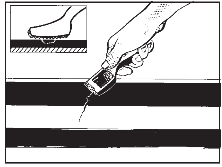
5. When the PE is hard, smooth the molten adhesive flush with the PE line coating by use of a point scraper.

Berry Plastics warrants that the product conforms to its chemical and physical description and is appropriate for the use stated on the technical data sheet when used in compliance with Berry Plastics written instructions. Since many installation factors are beyond the control of Berry Plastics, the user shall determine the suitability of the products for the intended use and assume all risks and liabilities in connection herewith. Berry Plastics liability is stated in the standard terms and conditions of sale. Berry Plastics makes no other warranty either expressed or implied. All information contained in this technical data sheet is to be used as a guide and is subject to change without notice. This technical data sheet supersedes all previous data sheets on this product.