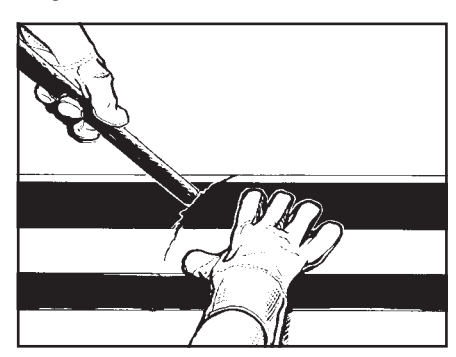
4. Spread the molten adhesive onto the damaged area.